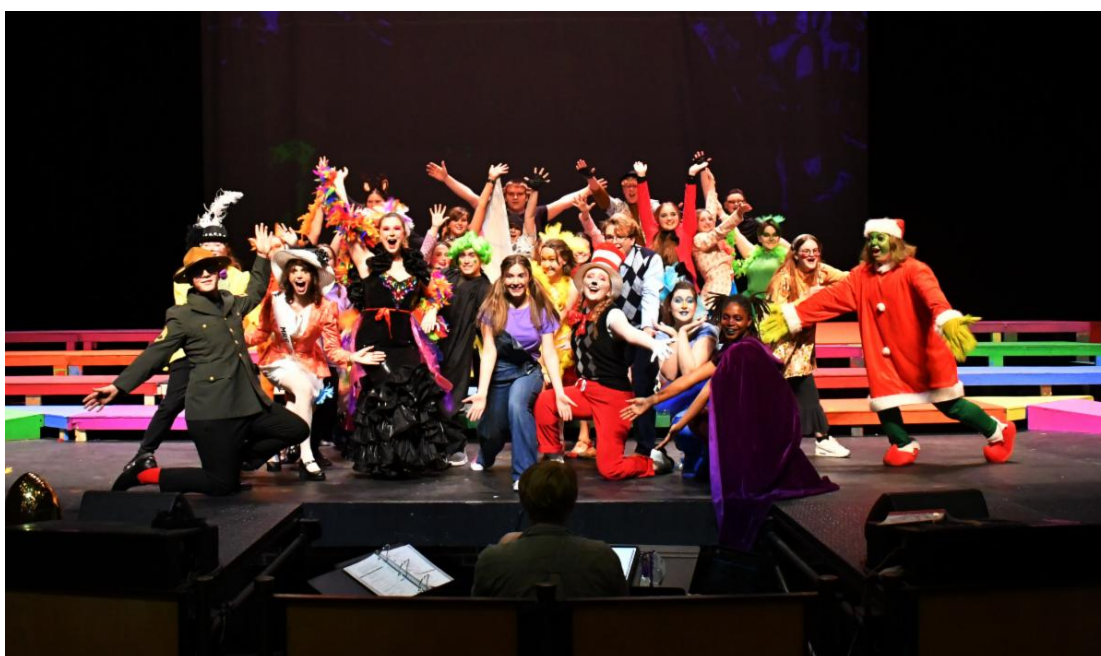
The Hopkins County Schools' presentation of "Seussical the